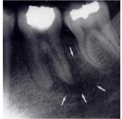
How a tooth abscess looks on a Dental X-Ray

If you experience any of the above symptoms, you should schedule an appointment with your dentist immediately. Your dentist will examine your teeth and may take an X-ray to determine the extent of the dental pulp problem. If the dental pulp is infected or inflamed, your dentist may recommend endodontic treatment.