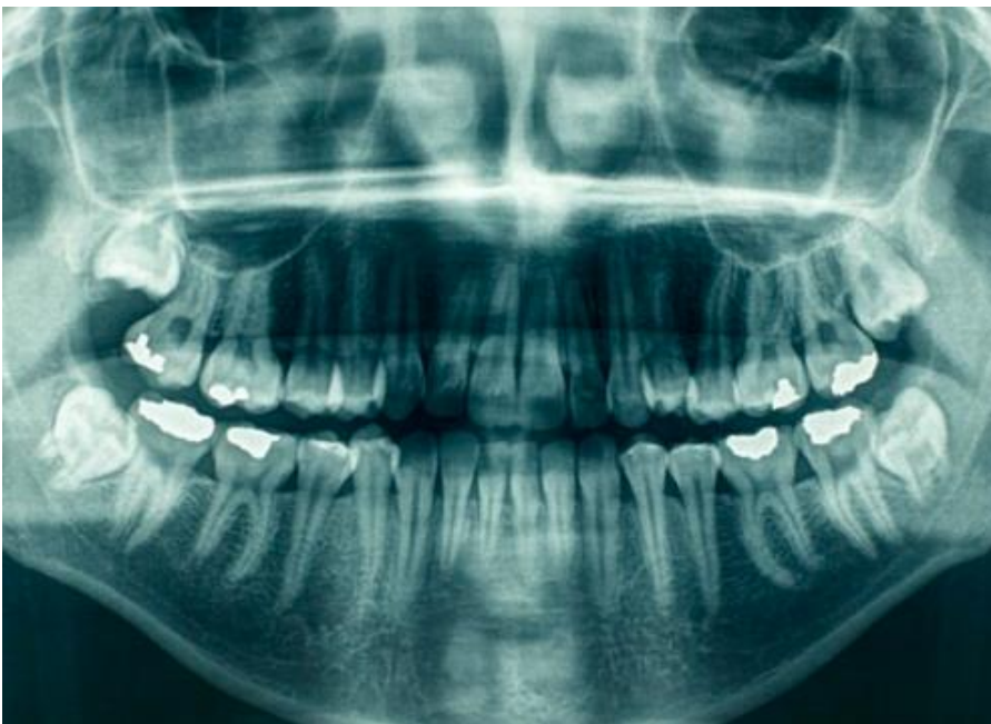
Image from a Panoramic X-Ray

Panoramic X-rays: Panoramic X-rays are used to diagnose problems with the teeth, jaws, and sinuses. They are taken with the patient standing or sitting upright and the X-ray machine moving around the head to produce a panoramic image.